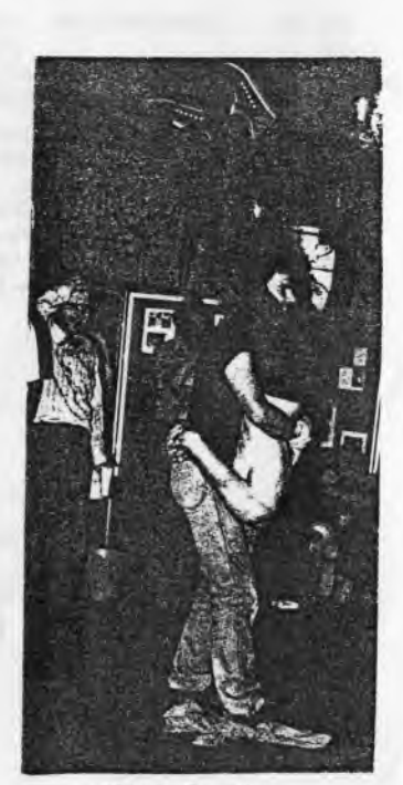
MITING A NEW POSITION