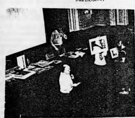
ROG IN ACTION