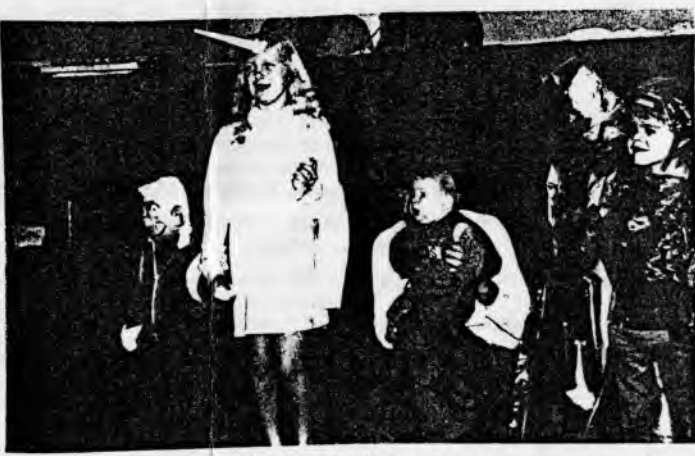
CHILDREN'S FANCY DRESS